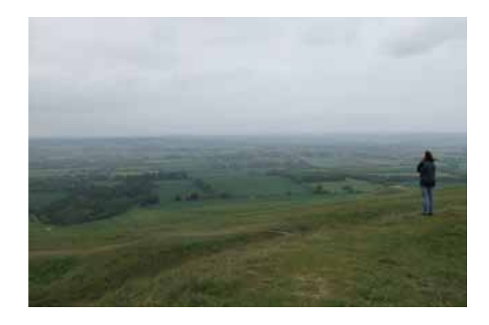
The hill top position with commanding views in all directions was ideal for a fort in Iron Age Britain

It has a single ditch and rampart. The rampart was certainly once deeper – perhaps by three metres – than it is today, and has become partially infilled over the years by the washing of material down the slope, the trampling of sheep, and the activities of earthworms.