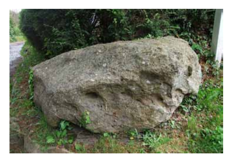
Sarsen stone in Woolstone village

Now these blocks of rock are called 'Sarsen stones'. Sometimes they have also been called 'greywethers' because where they appear in fields at a distance they look like sheep – and sheep used to be called 'wethers'.