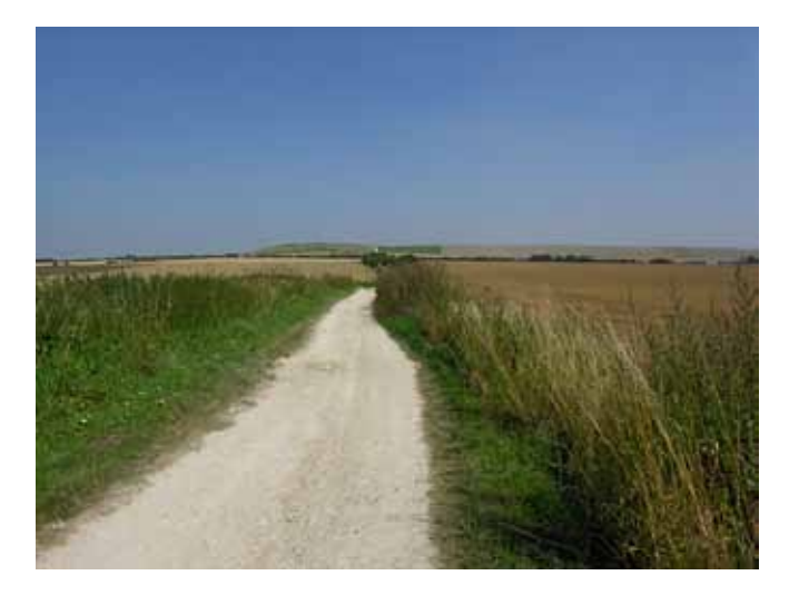
The Ridgeway, running along the chalk ridge

The National Trail (as it is today) extends for 139 kilometres (that's about 87 miles) from the great prehistoric stone circle at Avebury in Wiltshire to the Iron Age fort on top of the Chilterns at Ivinghoe Beacon. The ancient roadway, though, is longer than that and provided a link between Dorset and the Wash.