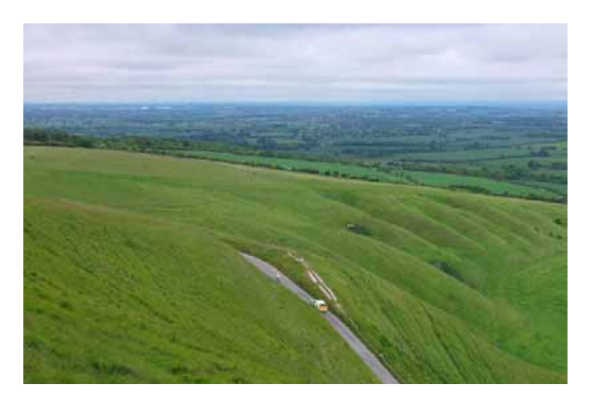
Giant's Stair, The Manger

At Uffington in South Oxfordshire, you can enjoy spectacular panoramic views, discover a unique collection of ancient landmarks and explore a picturesque village. This walk uncovers some of the stories behind and beneath this popular place.