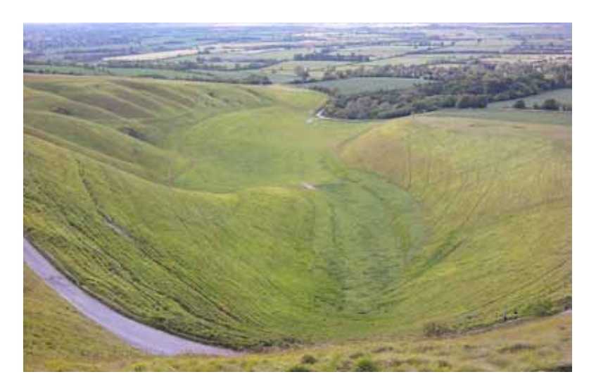
The Manger from above

It's a superb example of a feature that occurs widely in the chalklands of Britain which we call a dry valley. It is, indeed, a valley and it's also dry – there's no stream in it today – but it must have been created by a stream that no longer exists and so may be a product of climate change in the distant past.