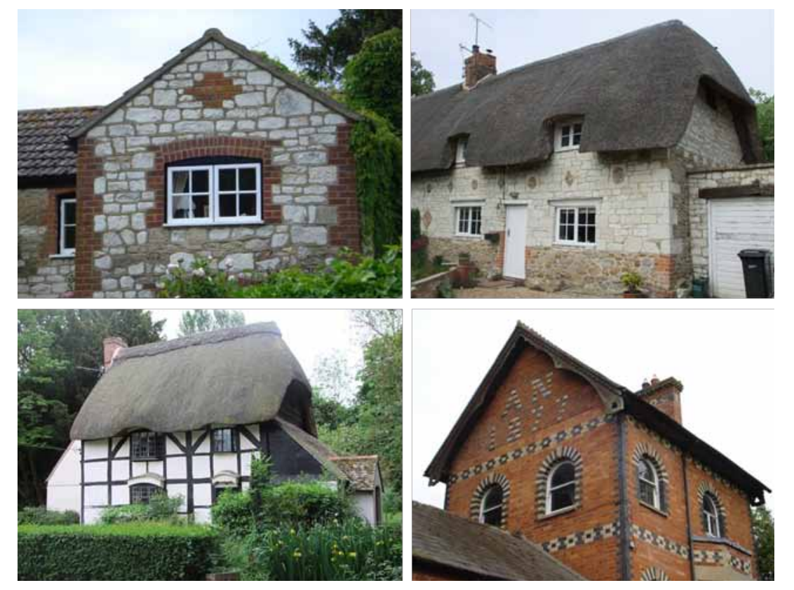
A mixture of building materials used for houses in Woolstone village

There is no good building stone as people would have used in the Cotswolds or in Dorset, so people used what they could find. One material that is used in the parish church is some relatively hard chalk called clunch and this forms the bulk of the upper walls. Elsewhere flints derived from the chalk have been used. The villagers also employed some blocks of local sandstone – sarsen stone – which we will discuss at our final stop.