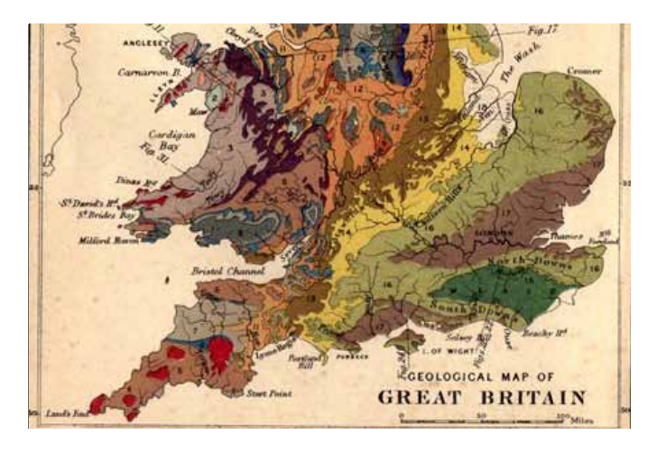
Section of a Geological Map of Great Britain The mid-green colour arching from Dorset up through the Chilterns to East Anglia is chalk

Let's orientate ourselves. If you are standing on the hill looking down at the valley, you are looking north. If you look to your left – which is a north-westerly direction – you should be able to see the Cotswold Hills – on a clear day at least!