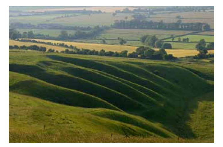
Avalanche chutes in The Manger

On the left hand side as you look down the valley, there is a series of more-or-less parallel trenches on the side. One theory for these is that they are the remains of features we find today in very cold areas – which we call tundra or peri-glacial areas – such as Siberia and Alaska.