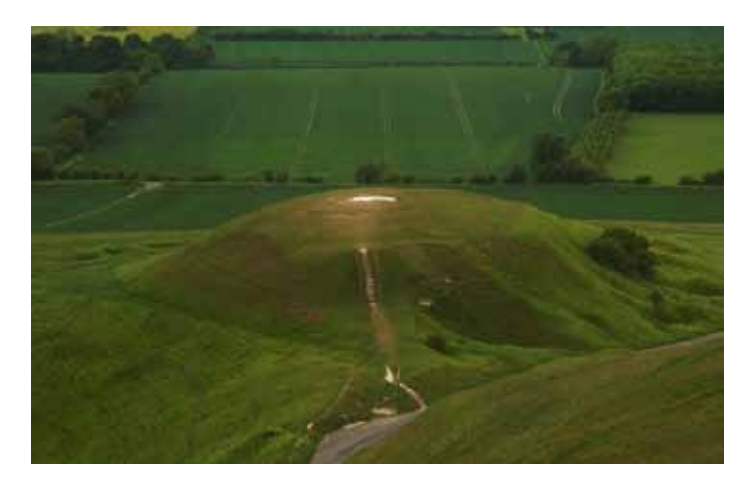
Flat topped Dragon Hill

Dragon Hill is a flat-topped mound, almost perfectly conical in shape. It has a level summit and this led to the assumption over the years that it was a man-made mound, similar to Silbury Hill near Avebury in Wiltshire. However, it is only the top that appears to be artificially flattened.