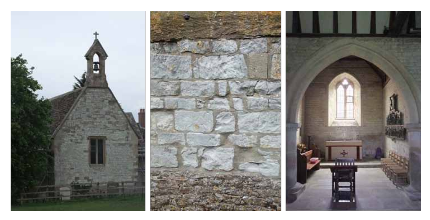
Woolstone Church with walls made from clunch

The church is very often open and it's well worth going inside because it's a beautiful church. One can see the clunch walls on the inside at close quarters. There is also abundant use of brick, perhaps made from the local clay, especially for vital parts of the building structure such as window arches, doorways and corners. Timber was also much used and there is a timber-framed public house in the village – the White Horse. For roofing, a great deal of thatch has been used because none of the local rocks make good roofing material. It is the rather random conjunction of all these different materials that gives the village so much of its charm.