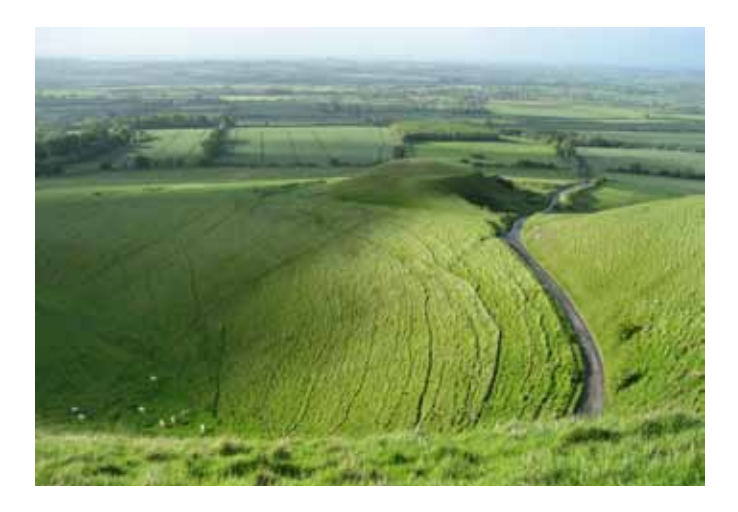
The ridge of hills dropping away steeply to the valley bottom are central to the story of this walk

Today we're in the southwest corner of Oxfordshire. The line of hills here forms a natural border and the other side is the county of Berkshire. We've also got Swindon and the county of Wiltshire to the west. I chose this walk not only because it's a great spot for a walk with wonderful views, but also because this landscape has a particular story to tell.