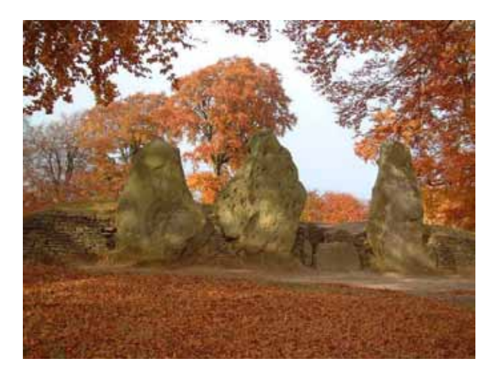
Sarsen stones at Waylands Smithy

These Sarsen stones are very widespread in southern England and were extensively used in the construction of all sorts of prehistoric monuments and they make up, for example, the stone circle at Avebury, the stones found at Waylands Smithy (which is just nearby on the top of White Horse Hill) and in the valley in which the Ashdown House lies (a house that looks like a French chateau and belongs to the National Trust, just a few miles to the south).