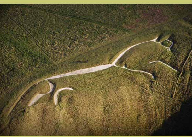
The White Horse, Uffington

A self guided walk around White Horse Hill in Uffington