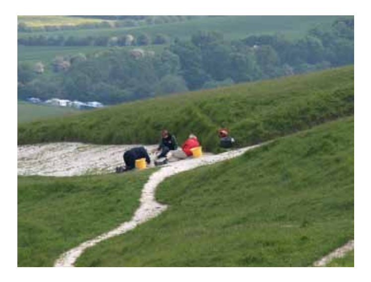
The White Horse being cleaned by volunteers

It's about 114 metres long (that's 374 feet) and is a sort of stylised representation of a horse, though some would say a dragon. It's formed from deep trenches filled with crushed white chalk. We used to think that – like the castle – it