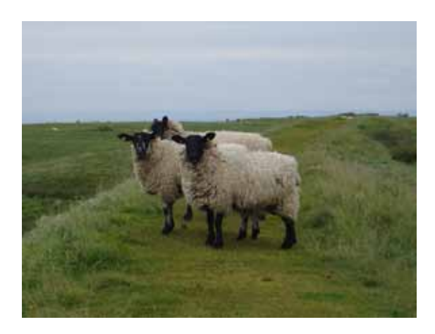
Nowadays, Uffington Castle is defended by sheep

The ramparts were also once topped by a timber palisade – a defensive line of stakes. The main entrance appears to have been on the north, which was protected by an earthen passageway that would have been further protected by wooden stakes. And smaller entrances through the south and northeast ramparts were created by the Romano-British during their occupation of the site.